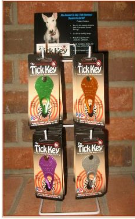
Holds up to 100 Keys & Signage